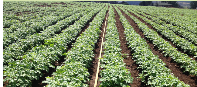
Organic Potato Field: Plants are strong and healthy resulting in resistance to pest and disease pressure, and resilience during periods of extreme weather.