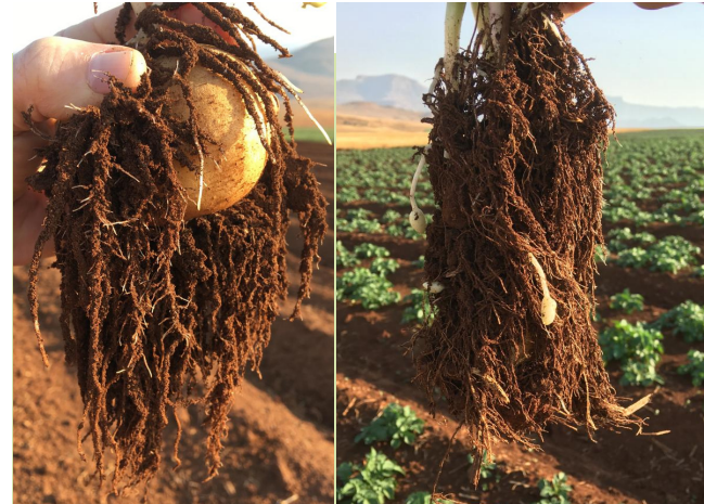
Good phosphate levels result in well-developed roots.