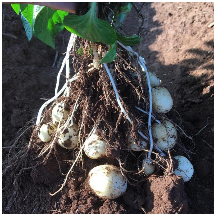
More and thicker stolons are a sign of ample nutrition

Another interesting observation took place, there was a brief insect infestation that took hold of the crop. The temptation was to spray pesticides, but instead of treating the symptom, the farmer and consultant looked for a root cause. The sap analysis indicated that there were some micro nutrient deficiencies. These