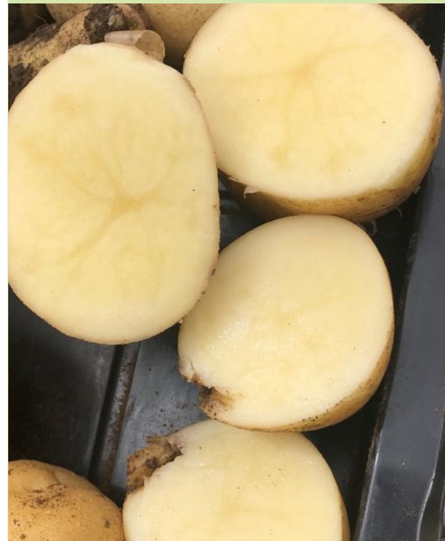
Superior quality first grade potatoes (Calcium evident) provide healthy, nutrient dense food to the market and better prices to the farmer. Health Soil = Healthy Plants = Healthy People

In this trial, there wasn't a major difference in yield, but there was a significant improvement in quality, with only 4% of the yield considered Undergrade. There was also a visible calcium deposit around the edges which is key to improving shelf life, giving farmers some flexibility to store products until the market prices are optimal. The nutrient density of the potatoes was evident, the one farmer joked: "Are these stones or potatoes?"