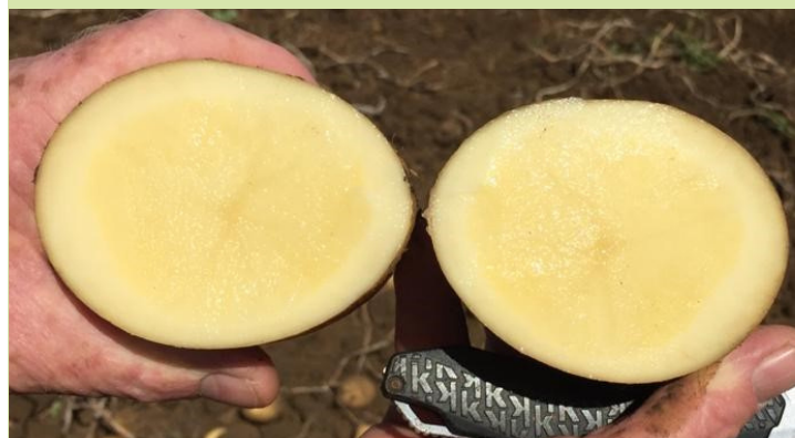
High levels of Calcium lead to increased density, quality, and shelf life. Hollow heart is greatly reduced or eliminated.

Healthy Soil = Healthy Plants = Healthy People